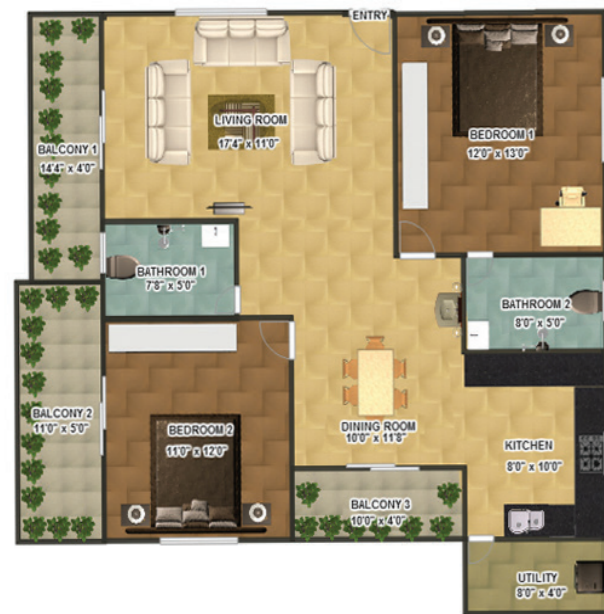
Flat 107, 207, 307, 407