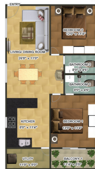
Flat 105, 205, 305, 405