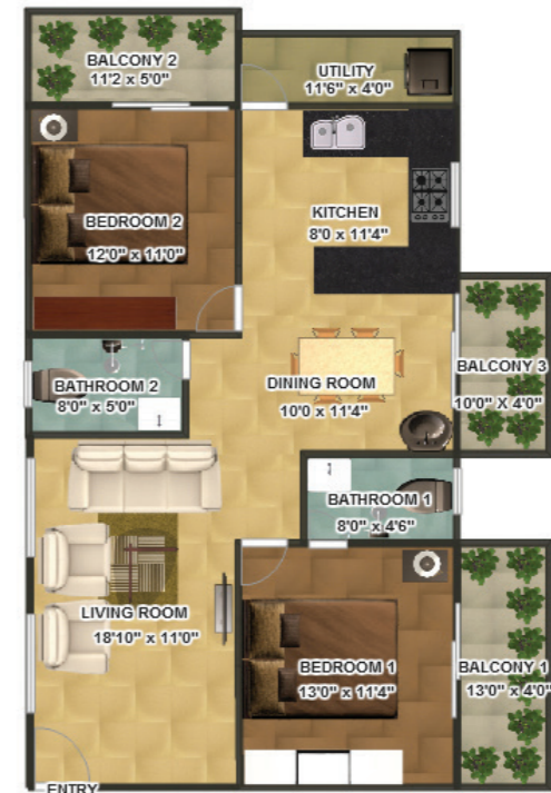
Flat 103, 203, 303, 403