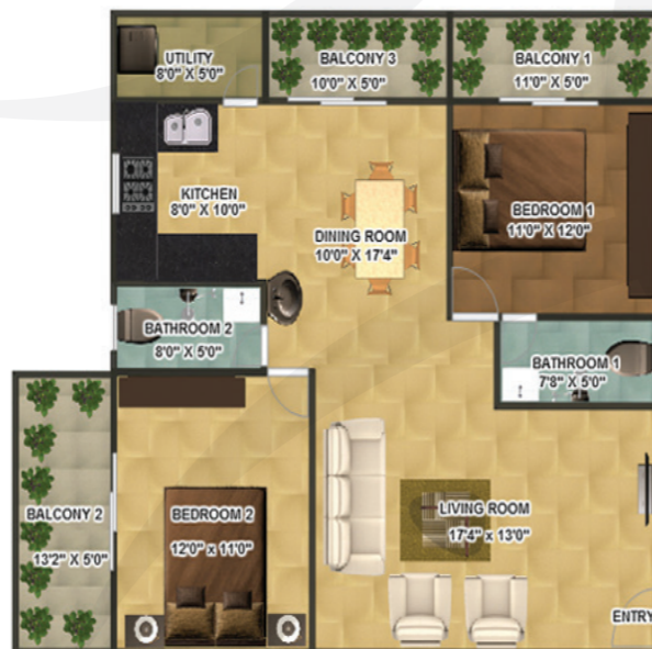
Flat 112, 212, 312, 412