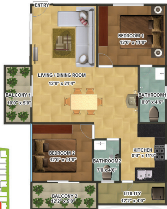
Flat 101, 201, 301, 401