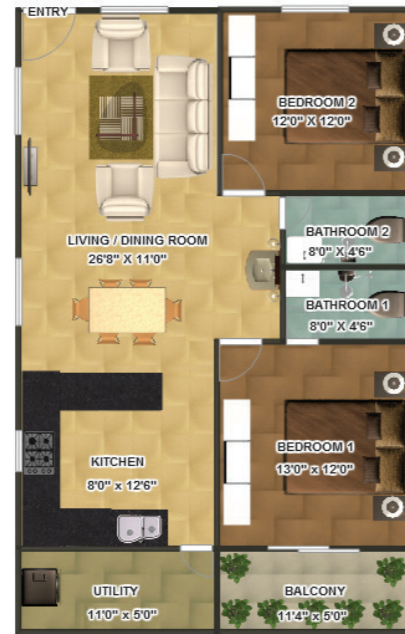
Flat 118, 218, 318, 418