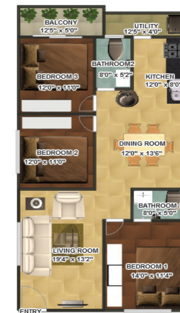
Flat 110, 210, 310, 410