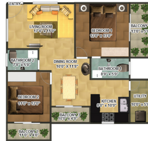
Flat 119, 219, 319, 419