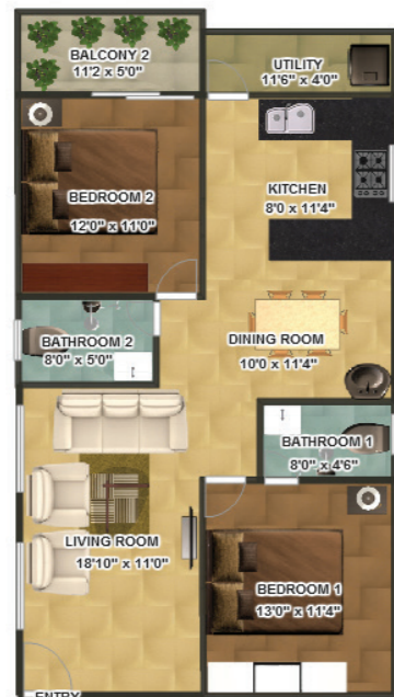
Flat 111, 211, 311, 411