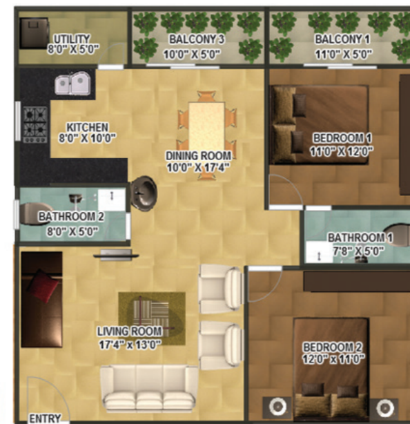
Flat 113, 213, 313, 413