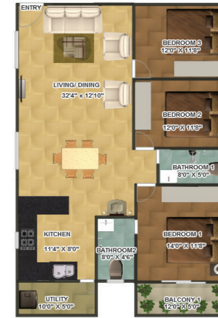
Flat 117, 217, 317, 417