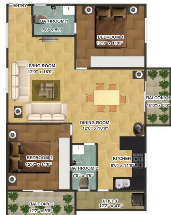
Flat 106, 206, 306, 406