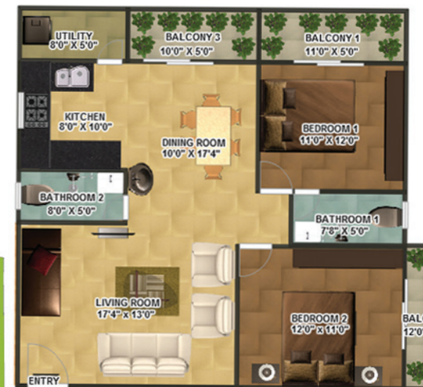
Flat 114, 214, 314, 414