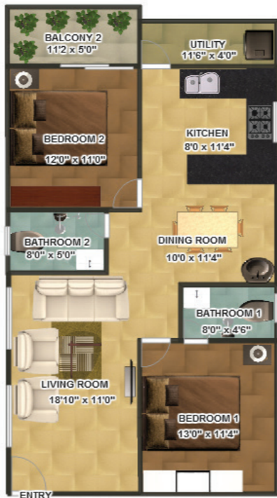
Flat 102, 202, 302, 402