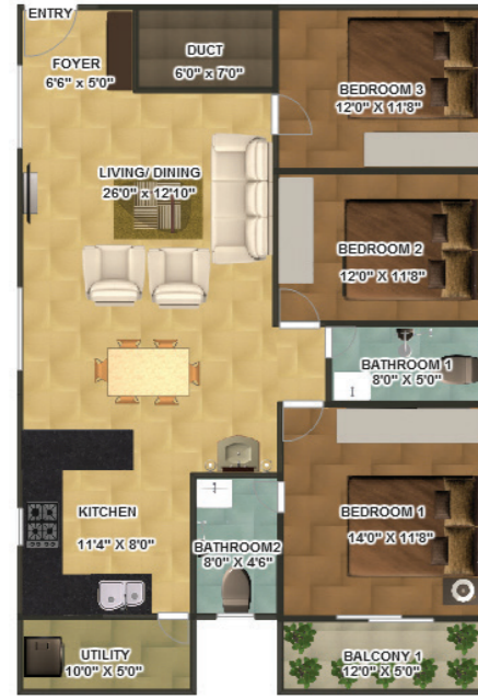
Flat 115, 215, 315, 415