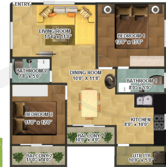
Flat 120, 220, 320, 420