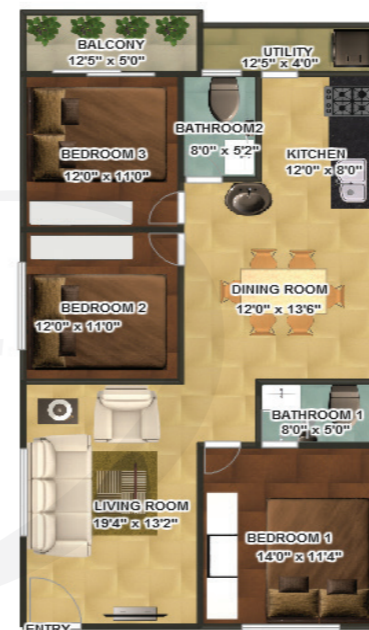
Flat 109, 209, 309, 409