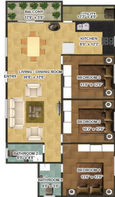
Flat 108, 208, 308, 408