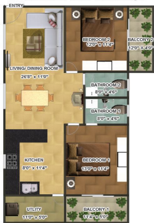
Flat 104, 204, 304, 404